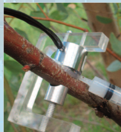
A Cooperation of UGT and ICT International